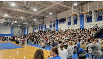
Spirit Week/Pep Rally