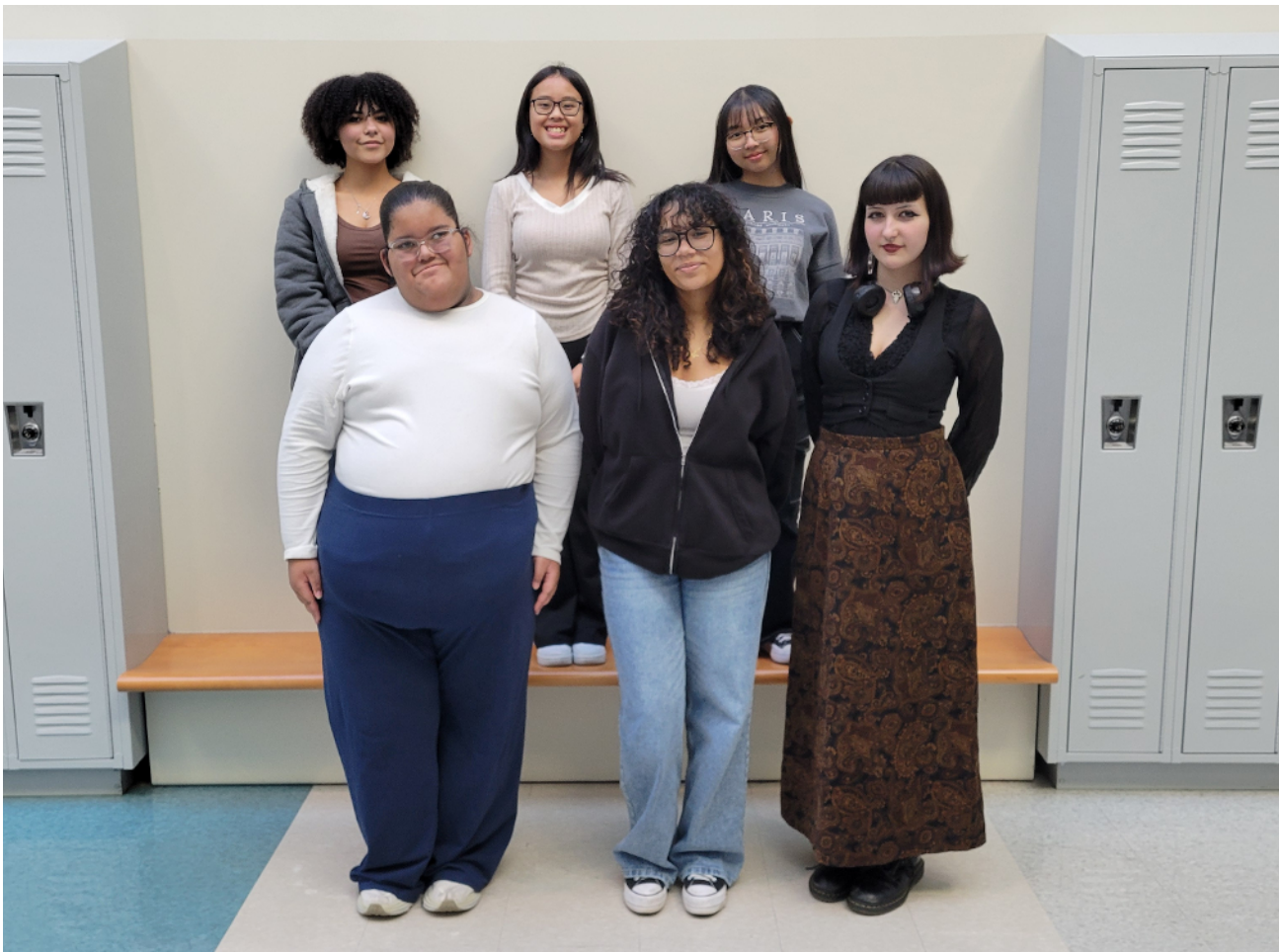
The 2024/25 Blue & White Staff