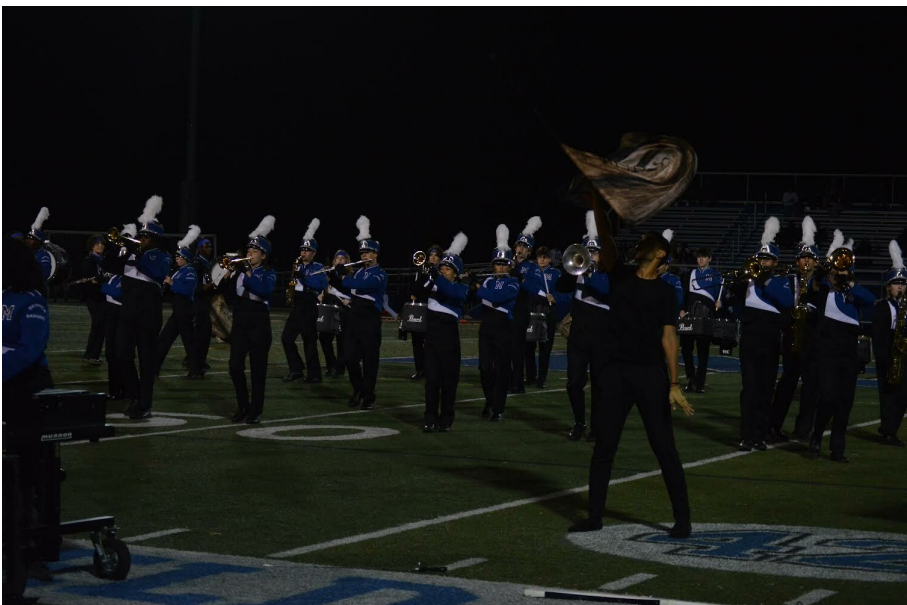
The marching band taking the field.