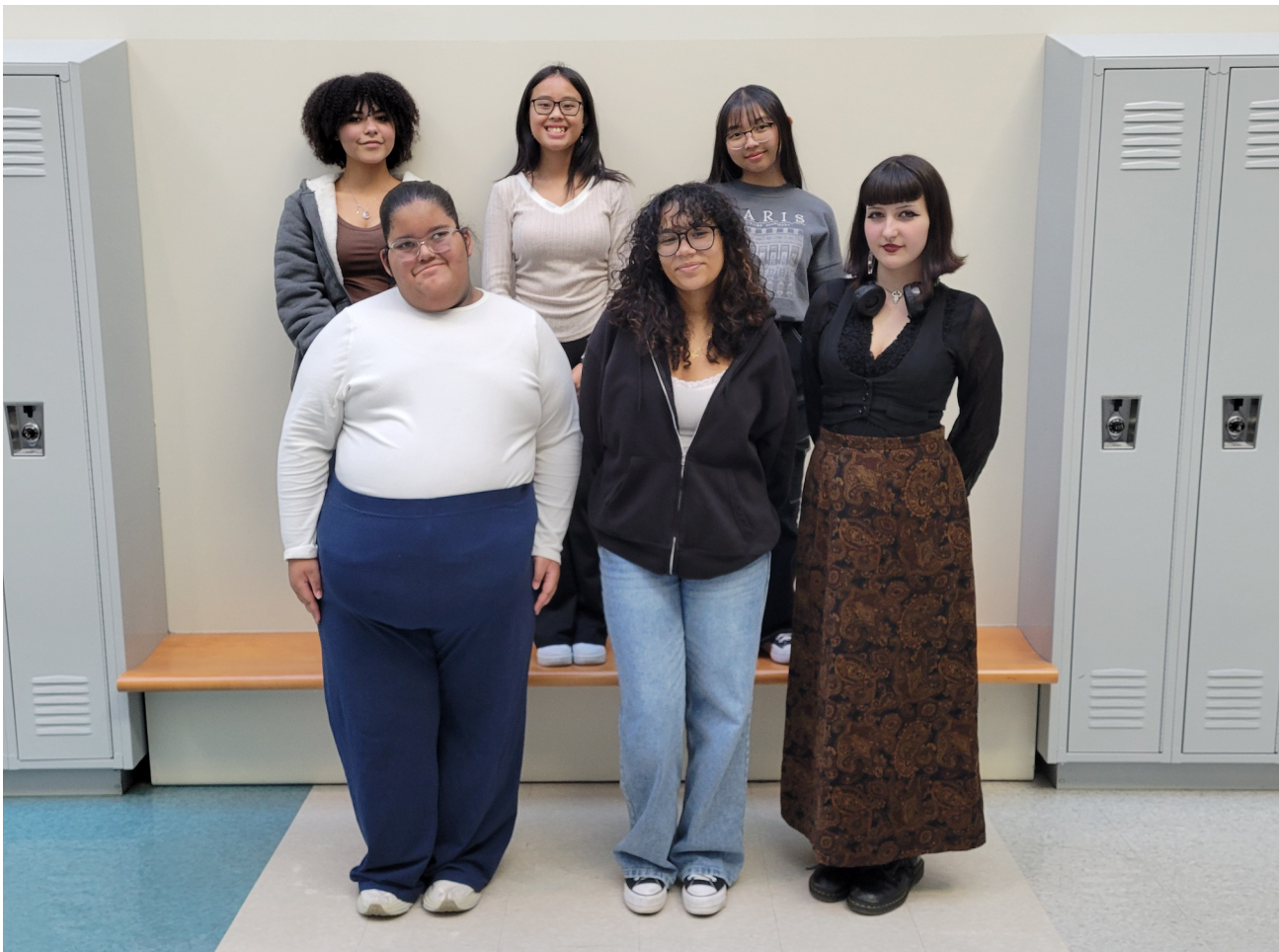
The 2024/25 Blue & White Staff