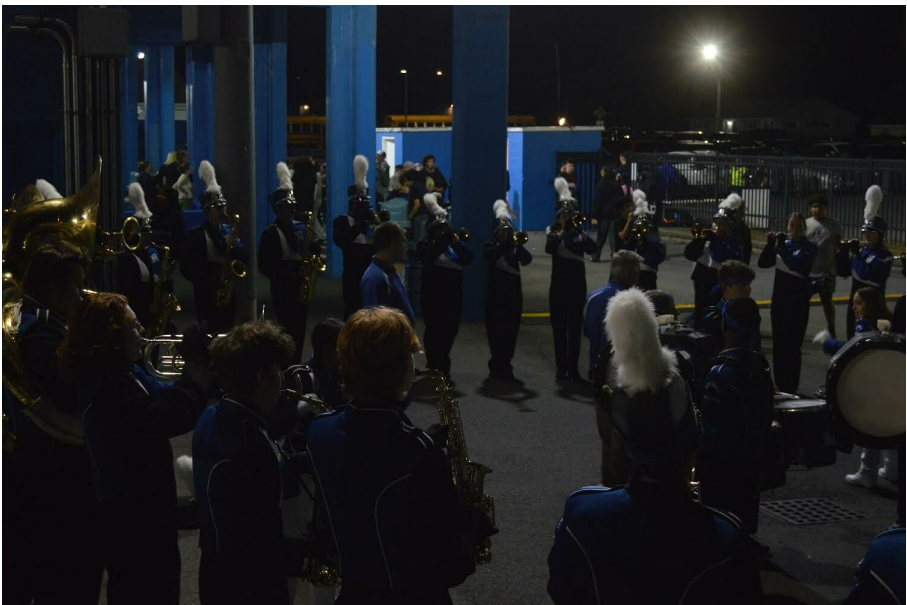
The marching band outside of Nicholson stadium.

For most high school students of Methuen, the first day of the 2024 - 2025 school year began on August 28th. However, for the Methuen Ranger Marching Band, the first day of the 2024 - 2025 school year was the end of June. The Marching Band has been in and out of the school, working on their 2024 show, ‘How to Train Your Dragon,’ since the end of June and will be working until early November. Their show is based on the movie, How to Train Your Dragon , and consists of four different movements, or songs, including Forbidden Friendship , Test Drive .