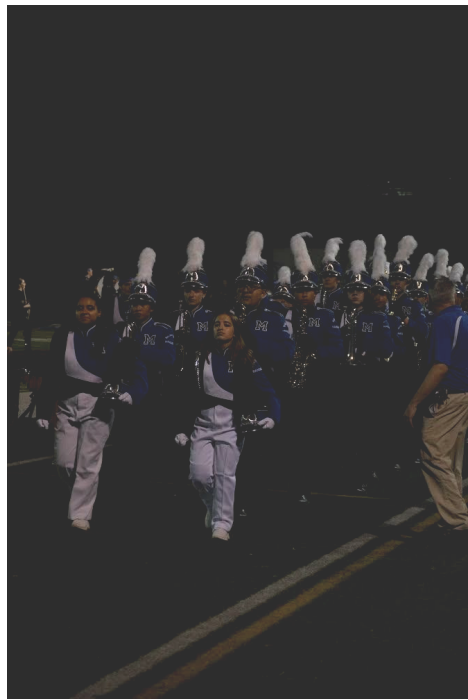
The band marches in formation. This is Berk, Romantic Flight, and Test Drive.

Their show has been showcased at Home Varsity Football games during halftime, as well as at their competitions during October. The Marching Band competes under the organization, NESBA, or New England Scholastic Band Association. NESBA is divided into different divisions based on size, the band being division five. Competitions are judged in three different categories, Overall Effect, Ensemble Analysis, and Individual Performance. The Marching Band’s first competition was in Westford on October 5th, scoring a 78.990 and placing 4th. The Marching Band currently has 3 more competitions in Reading, Wakefield, and Finals, with the location still being determined.