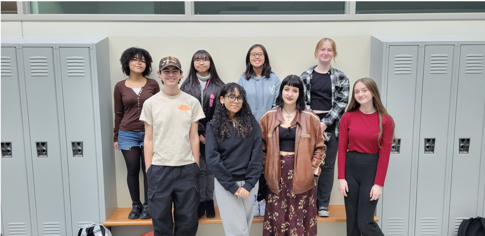
The 2023/24 Blue & White Staff