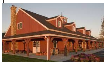
The BARN at Mann Orchards

Improvements and additions to the front entrance include a fenced patio, electronic sign, sidewalk safety barriers, and 'main entrance' lettering.