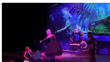
The Little Mermaid