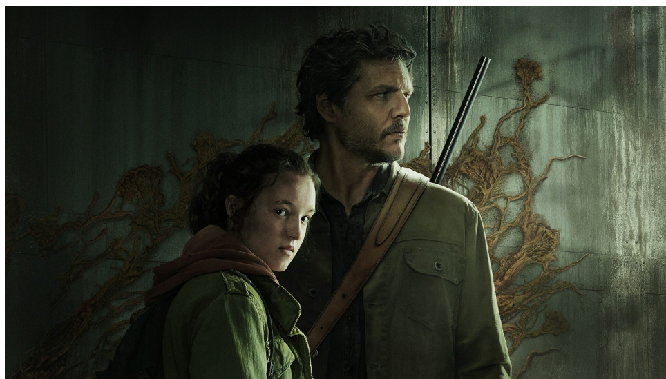
Bella Ramsey and Pedro Pascal Portray Ellie and Joel, respectively.