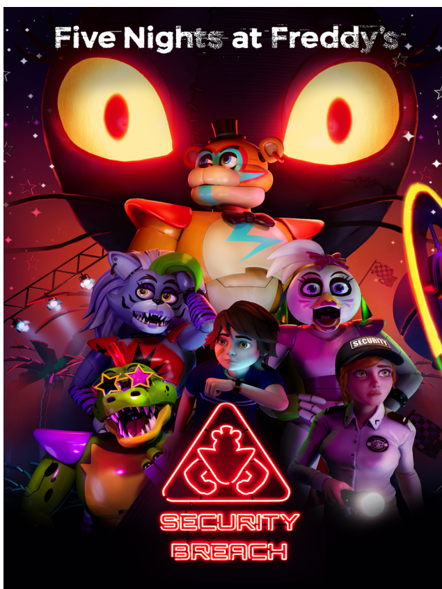
Promotional art for Five Nights at Freddy's: Security Breach.

In FNAF Security Breach , players play as a young boy named Gregory. He manages to lock himself in a Pizzaplex and has to face challenges and deal with dangerous animatronic enemies. He also finds himself in trouble with the security guard named Vanessa. Luckily, you have one animatronic, Freddy Fazbear, who helps and guides you through the missions. You can even temporarily hide inside of him and control him in certain parts of the game.