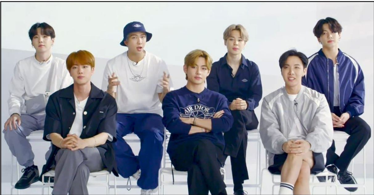
The popular K-pop band, BTS.