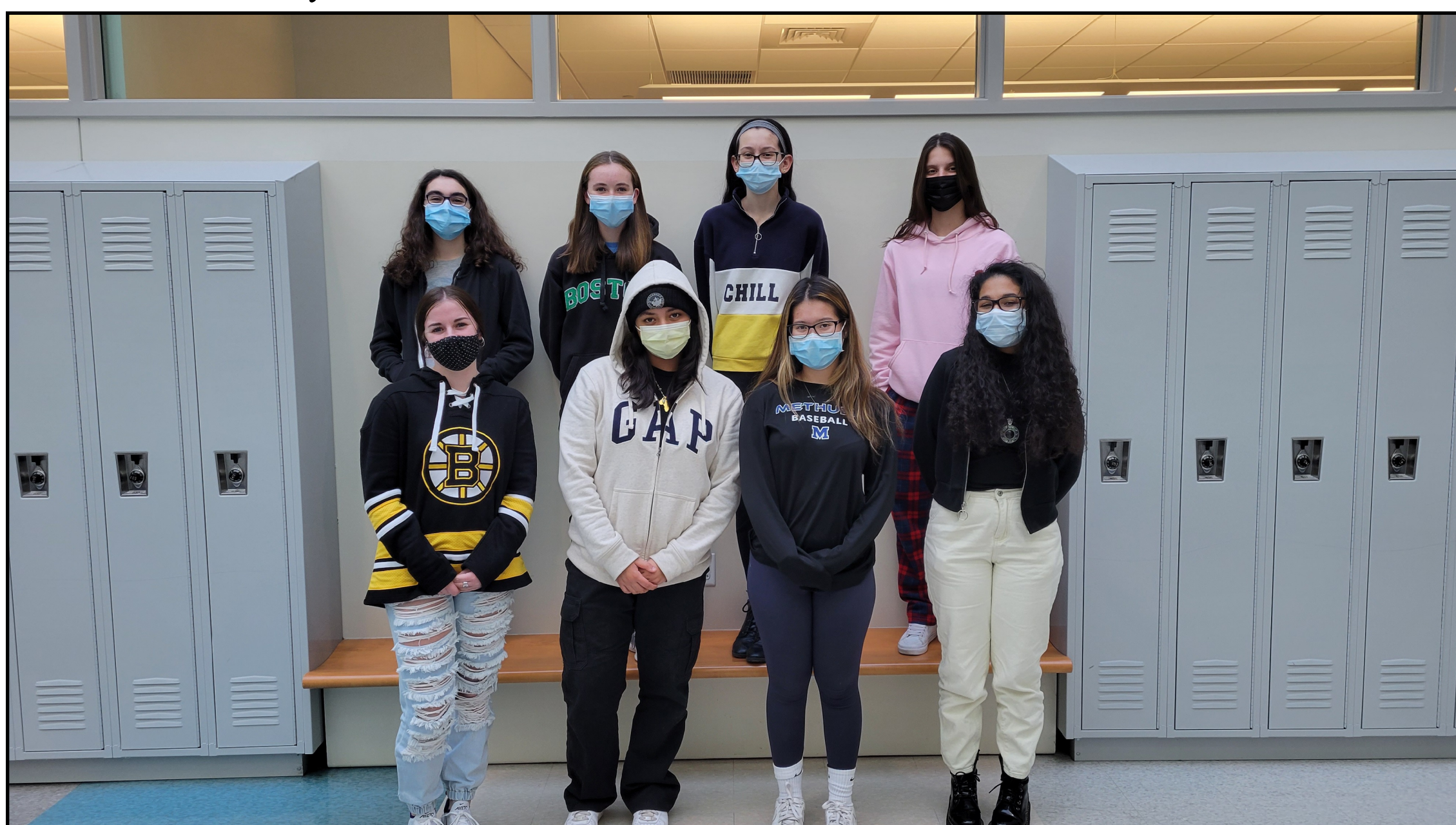
The 2021/22 Blue & White Staff