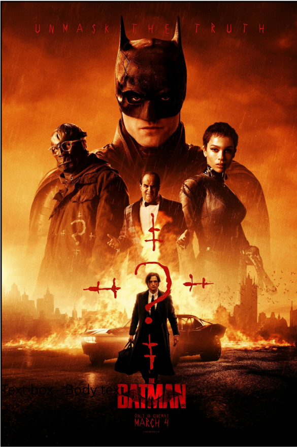
A promotional poster for The Batman .

In addition to the pressures of portraying Batman well, Pattinson has also had to deal with backlash from the DC fanbase when he told the press that he wasn't preparing for the role in the ways that people had hoped. In an interview for a cover story for the June/ July 2020 issue of GQ magazine, Pattinson told GQ that he wasn't consistently working out to match Batman's physique.