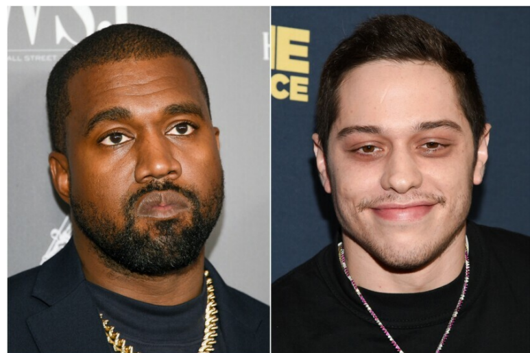
Kanye West (left) and Pete Davidson.