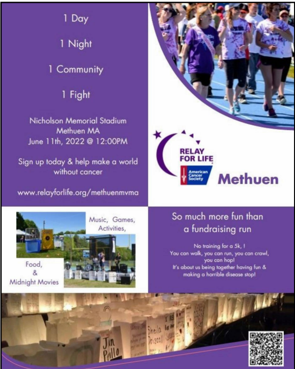
The Relay for Life Methuen flyer.

www.relayforlife.org/methuenmvma . Join the fight and let’s work together!