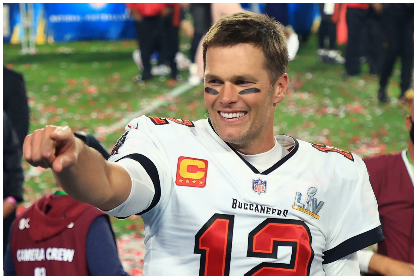
Tom Brady celebrating his 2021 Super Bowl win with the Tampa Bay Buccaneers.