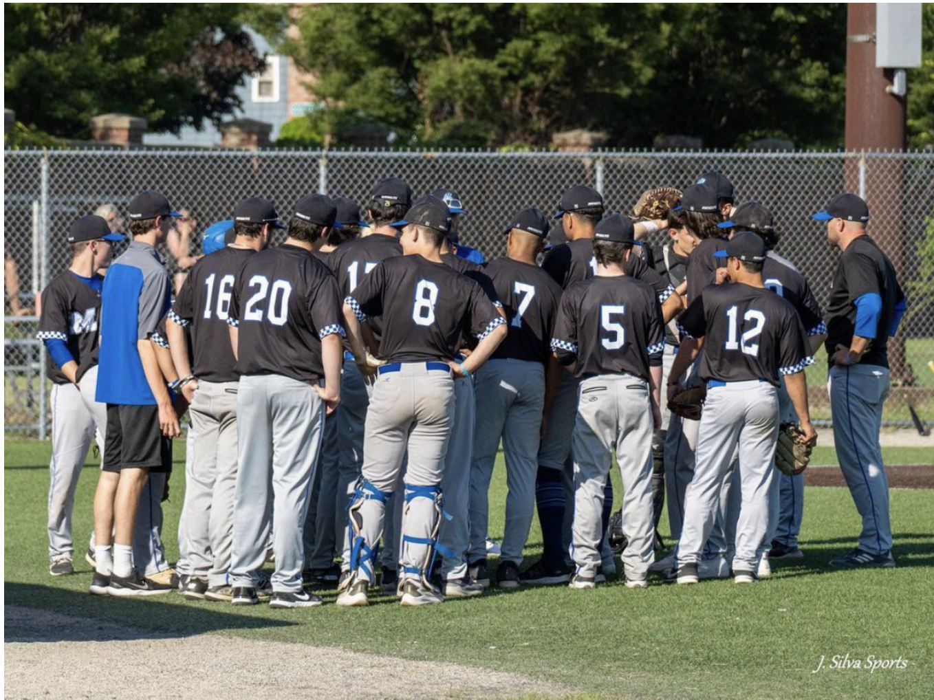
The boys' baseball team huddling up.