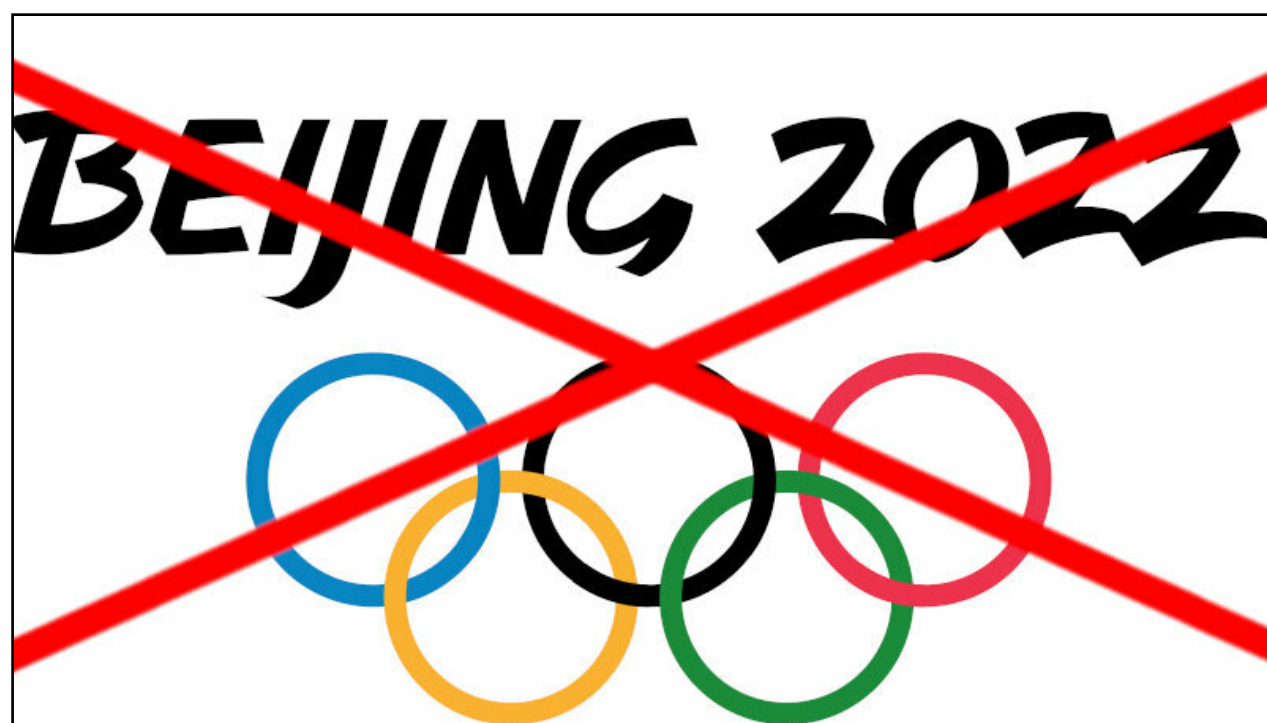
Calls to boycott the 2022 Olympics, held in Beijing, China, have come from all corners of the world.

With all the controversy that's surrounding this year's Olympic Games, human rights activists around the world have taken a stand to protest against the Beijing Games.